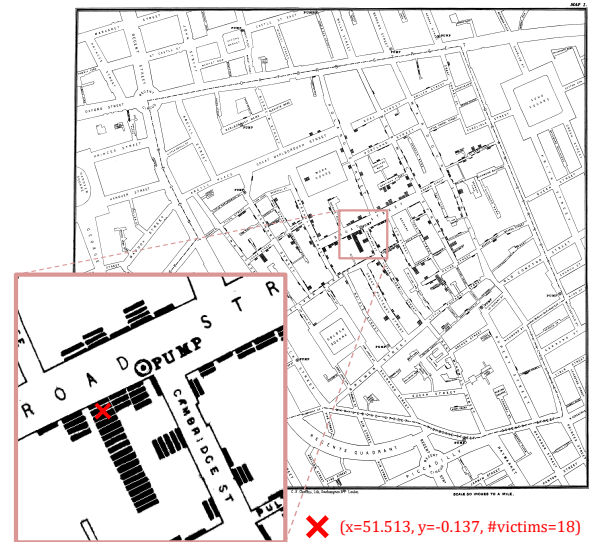
Figure 1: John Snow's Cholera Map [13] contains 321 data points. Each data point is a tuple (x, y, \#victims) , representing the latitude and longitude of a location, and the number of victims at this location.

In this section, we describe our experience of using simulation to estimate the cost of interactions and to compare different IVML methods with fully manual labelling and fully automated ML.